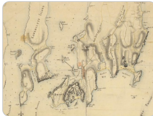
"[Narragansett Bay and Rhode Island]". Fage.

Link: https://quod.lib.umich.edu/w/wcl1ic/x-8353/wcl008423 .