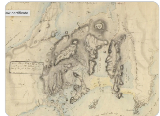
Original plan of Brentons Neck; and all the ground to the southward of the town of New-port Rhode Island, 1779 / E. Fage.".

Link: https://quod.lib.umich.edu/w/wcl1ic/x-8265/wcl008334 .