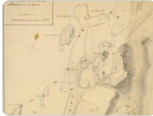
"Plan of the town of Newport and the adjacent country, with a project for its defence.". Link: https://quod.lib.umich.edu/w/wcl1ic/x-8276/wcl008345 .