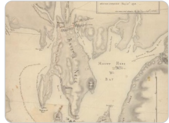
"Plan of the adjacent coast to the northern part of Rhode Island, to express the route of a body of troops under the command of Lieut Colonel Campbell May 25th 1778 /drawn by Edwd Fage, lieutt. of artillery.". Link: https://quod.lib.umich.edu/w/wcl1ic/x-628/wcl000739 .