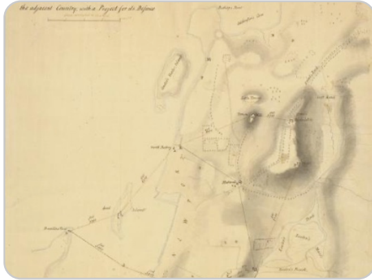
"Plan of the town of Newport, and the adjacent country; with a project for its defence : (No. 7).". Link: https://quod.lib.umich.edu/w/wcl1ic/x-8275/wcl008344 .