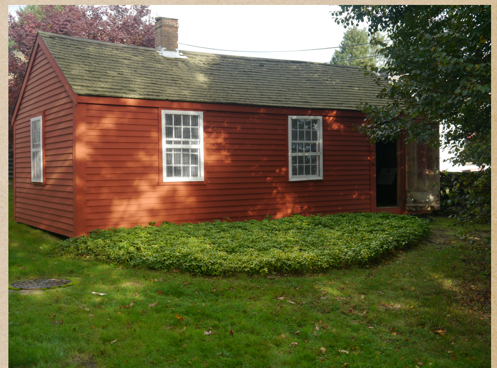
Old Town Hall 1848 Southernmost School 1725 Christian Union Church 1865