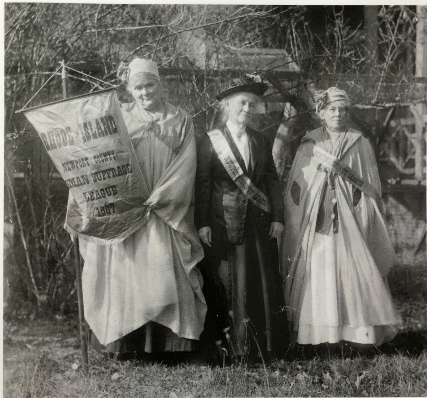
The Women of the Newport County Woman Suffrage League