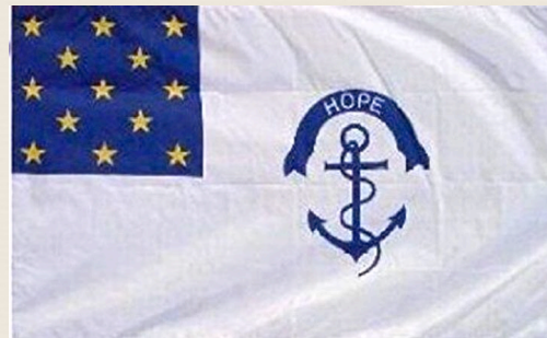
Rhode Island Regiment Flag Was the Flag of RI 2nd Regiment

31 MAY 1778: BRITISH RAID TIVERTON AND FALL RIVER