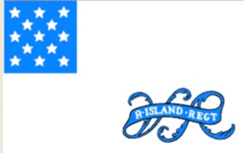
RI 1st Regiment Flag

4 MAY 1776: RI LEGISLATURE BREAKS ALLEGIANCE TO KING GEORGE III.. FIRST DECLARATION OF INDEPENDENCE IN THE COLONIES.